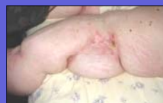
2 months later