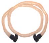
Hose $50 + S/H