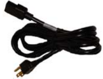
Power Cord $10 + S/H

Did you misplace the power cord? Or did the dog chew your appliance? Don't worry! We have the replacement parts you need for just these situations.