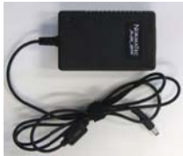
AC-DC Adaptor $45 + S/H