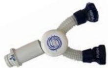
Y-Connector $65 + S/H